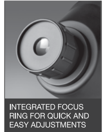
INTEGRATED FOCUS RING FOR QUICK AND EASY ADJUSTMENTS